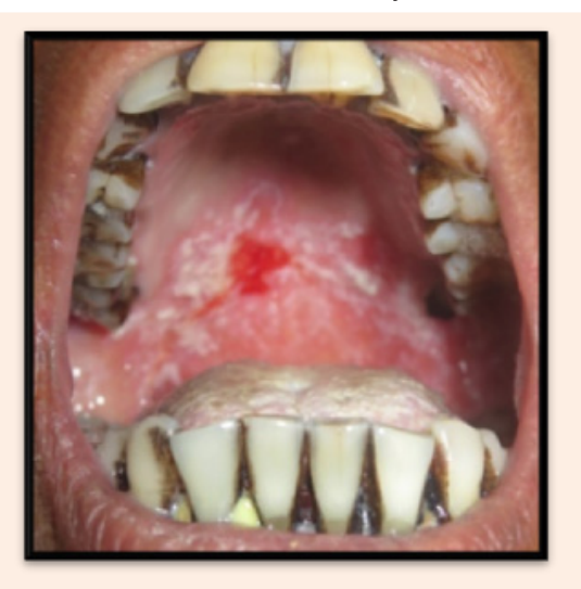
Figure 1: Shows the erythematous region in the palate.

separately and sent to the department of Oral Pathology & Microbiology. For cytological evaluation, KOH Staining and H&E staining were done which shows fungal elements. Culture Candida using a Sabouraud's dextrose agar was also done to aid the definitive identification of the fungal organism. Histopathological report confirms the diagnosis as pseudomembranous candidiasis. Patient was advised for CANDID mouth paint twice a day for 15 days. And patient was recalled after 15 days. So, there was a complete remission of the lesion on the day of call.