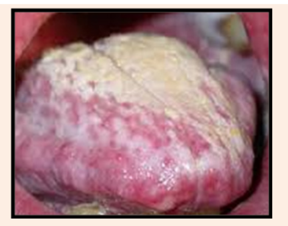
Figure 2: Shows curdy white coat on the tongue.

The lesions were scrapable and left diffuse erythematous areas and bleeds on scraping. Smear made from scrapings of lesions were sent for cytological examination which confirmed the presence of candidal hyphae (Figure 3).