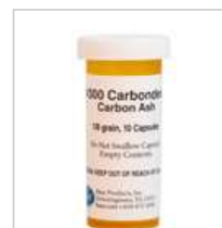
Carbondex, Carbon Ash 1/8gr Item #300 Price: $39.95