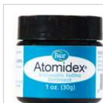
Atomidex, Antiseptic Iodine Ointment Item #393 As low as: $14.95