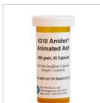
Anidex, Animated Ash 1/8gr Item #310 Price: $49.95