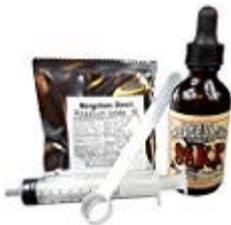
Morgellons Direct Potassium Iodide Mixin...