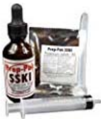
Prep-Pak Potassium Iodide Mixing Kit