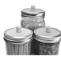
6-Pack Waterless Airlock Fermentation Lids for Wide Mouth Mason Jars, Mold Free, Food-Grade...