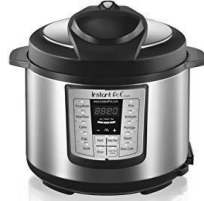
Instant Pot LUX60V3 V3 6 Qt 6-in-1 Multi-Use Programmable Pressure Cooker, Slow Cooker,...