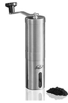
JavaPresse Manual Coffee Grinder, Conical Burr Mill, Brushed Stainless Steel