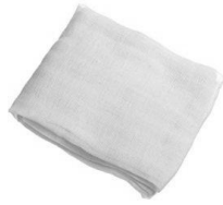
Regency Natural Ultra Fine 100% Cotton Cheesecloth 9 sq.ft