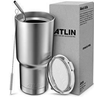
Atlin Tumbler [30 oz. Double Wall Stainless Steel Vacuum Insulation] Travel Mug [Crystal Clear...]