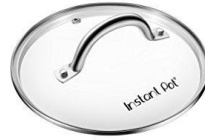
Genuine Instant Pot Tempered Glass Lid, 9 in. (23 cm), 6 Quart, Clear