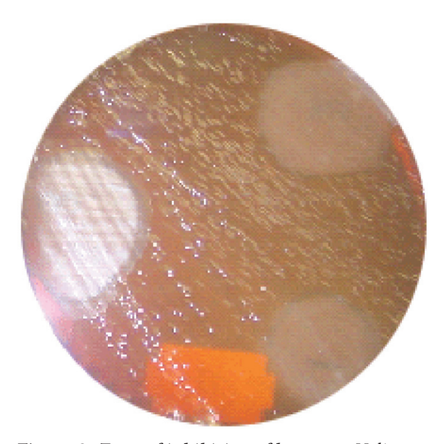
Figure 2: Zone of inhibition of honey on Helicobacter pylori on chocolate agar.

These were provided from departmental stock cultures. The organisms were checked for purity by inoculating them onto Campylobacter and chocolate agar media and incubating microaerophilically (CO2 10%, Oxygen 10%, Nitrogen 80%) for 5 days at 37°C. Grown colonies were Gram stained and observed for spiral shape, oxidase and urease activities. Spiral shaped, urease and oxidase positive colonies typical of H. py lori were used in the experiment.