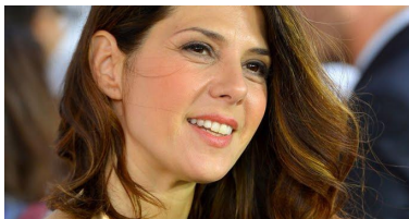
Hairstyle Ideas 50+