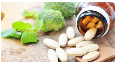
2018 Best Hair Growth Vitamins - Which Brand Is Most Effective?