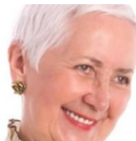
Go all grey by using a product to remove hair color.