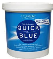
How does bleaching hair or decolorizing hair work?