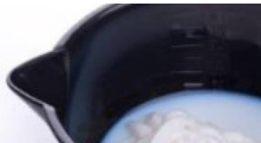
Formula to mix different volumes of peroxide to come up with different strenghts