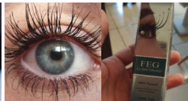
My Lash Growth Trick