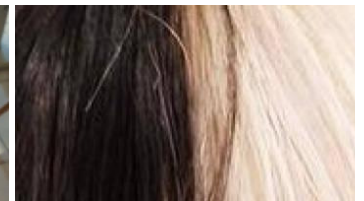
Going from brown to blond hair with bleach and peroxide