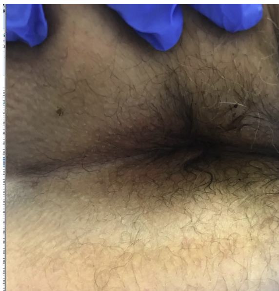
Fig. 2. Resolution of perianal dermatitis after initiation of perianal dermatitis (week 4 from initiation of therapy).