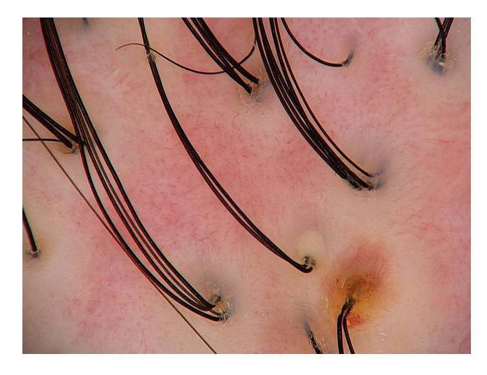
Figure 3 Trichoscopy showing follicular tufts, pustules and dilated blood vessels in an area of scarring alopecia.