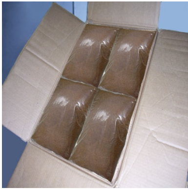
25 x 1 Kg Box