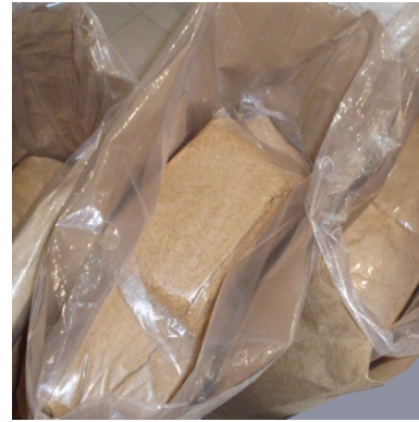
25 x 1 Kg Kraft Bag