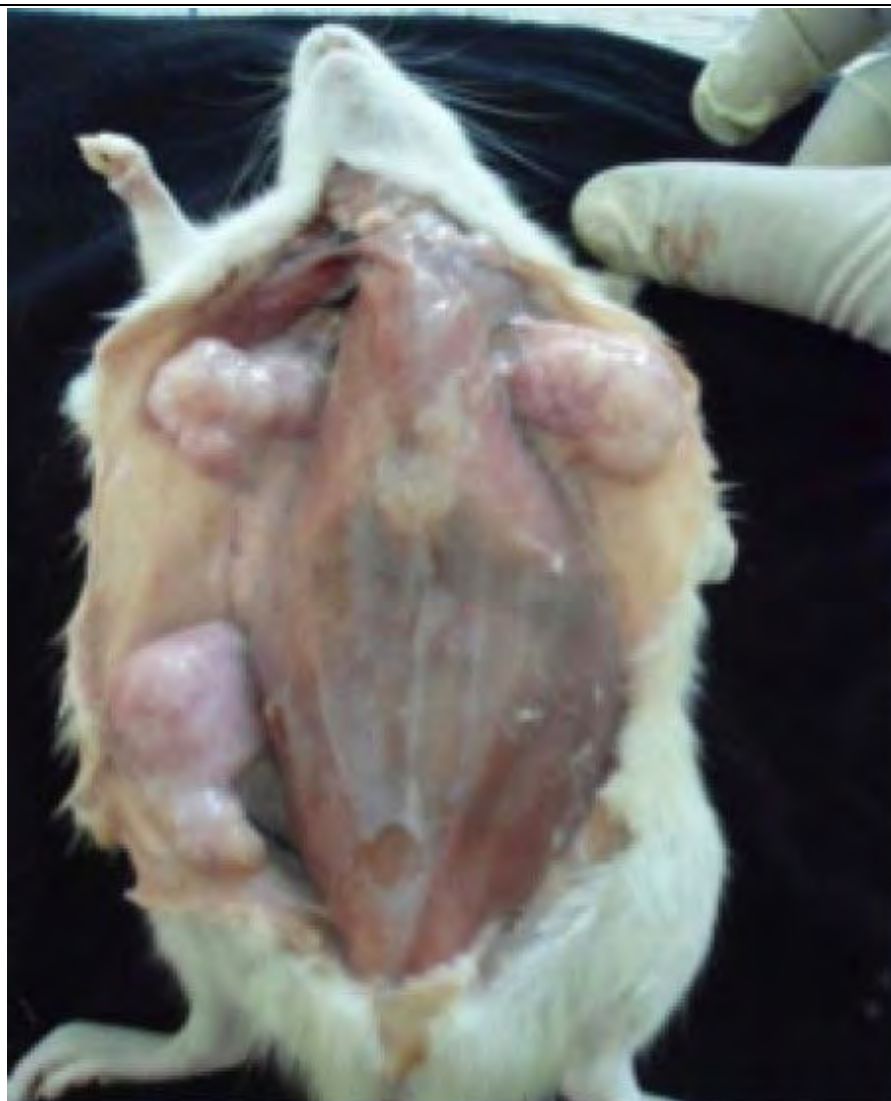
Intact multiple tumors of the MNU control rat.