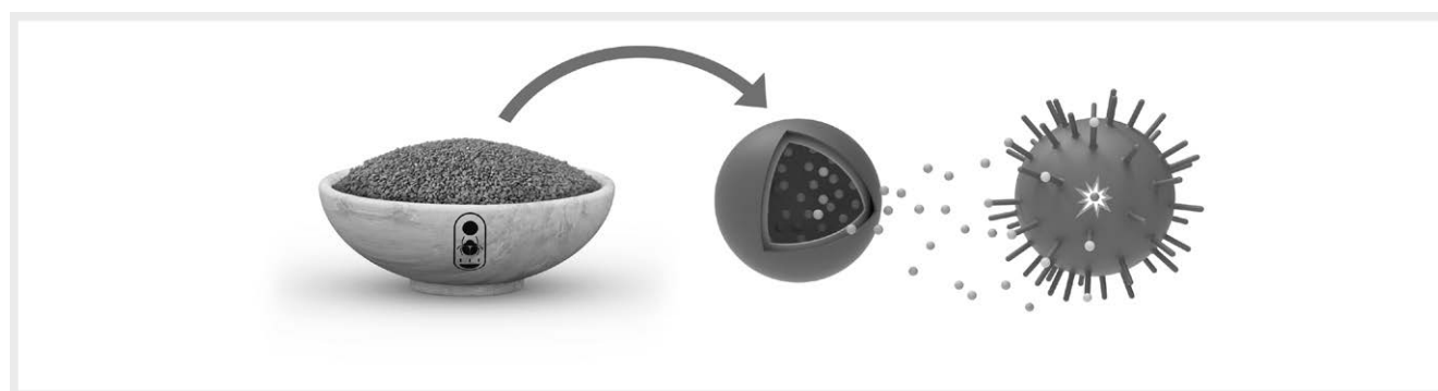
► Fig. 1 Left: Black cumin, discovered in Tutankhamun's tomb, is a valued ingredient in the Egyptian cuisine. Middle: Illustration of one principle applied in nanomedicine: a drug (small spheres) is loaded into a biodegradable capsule, which is enclosed by a second capsule. The function of the outer capsule is comparable to that of a time bomb, it dissolves at a certain time point to safeguard that the cargo is not dispersed prior to reaching the target organs. The inner capsule is engineered such that it binds to the target organ cells via chemical affinity. Once it has reached the target organ it releases its cargo. Right: The drug binds to the fusion spikes of SARS-CoV-2, thereby inhibiting its attachment to cells. This scenario needs a large number of drug molecules, where spikes and molecules need to have comparable dimensions. In a best case scenario, the drug molecules break through the spike shield, enter the interspike space, bind to the lipid envelope, and oxidize the virus. The probability for this event is controlled by the polarity contrast between drug, spike and lipid envelope as well as by the surface density of the coffin nail shaped spikes. These ports of attack are different from the standard drug docking target envisaged in Covid-19, namely the membrane-associated-angiotensin-converting enzyme 2 (ACE2) receptor: the port of entry of SARS-CoV-2. [7]. Binding to the viral spike and/or lipid envelope and oxidizing the virus, instead of blocking cell receptors is equivalent with minimizing the adverse effects of a drug – a novel pharmacological approach, which could be fully exploited by the use of nanomedicines designed according to the principles summarized in ► Fig. 2 . NB: ► Fig. 1 is a visual transcript of the title of our article.