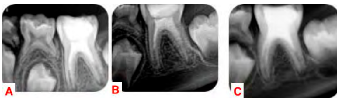
Figure 2. (A) Recall radiograph at three months. (B) Recall radiograph at nine months. (C) Recall radiograph at twelve months.

In the 3, 9, 12 and 24-month follow-ups, the tooth was asymptomatic. Clinical examination showed physiological mobility and absence of sensitivity to percussion and palpation. The follow-up radiographs revealed complete periapical healing in the mesial and distal roots at 9 months, with apical closure as well as significant increase in root length and dentin thickness at 12 months. Cone-beam computed tomography (CBCT) (Carestream, CS8100) with a small field of view (FOV) was used at 24 months to assess radiographic changes after regenerative endodontic procedures, allowing for axial and oblique views of the roots and bone (Figures 2 and 3).