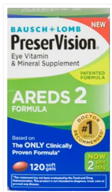
— New PreserVision AREDS 2 (click to enlarge)